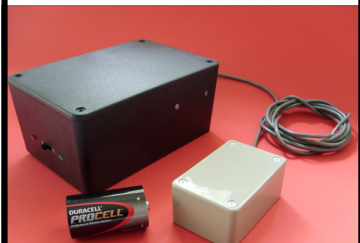
STS 914 Miniature Box Source

For training where the source may be approached from any direction, radiation is emitted from each of the six faces allowing detection in all horizontal directions. (150x80mm)