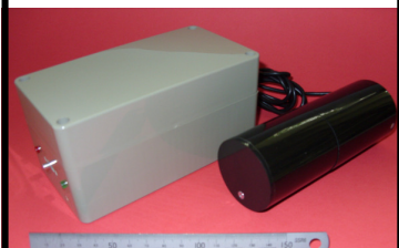
STS 912 Pipe Source

Designed so that it can be easily hidden in small gaps in walls floors and ceilings in a training area It is operated by the STS Power Supply with a 5m cable.(45x70x90mm)