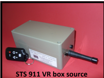
STS 911 VR box source

The radiation emerges from one end in a cone with an angle of approx 120 degrees. Powered by 4 C cells installed in the case.(70x80x140mm)