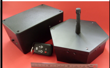
STS 913VR Hex Source

The radiation emerges from one end in a cone with an angle of approx 120 degrees. Powered by 4 C cells installed in the case.(70x80x140mm)